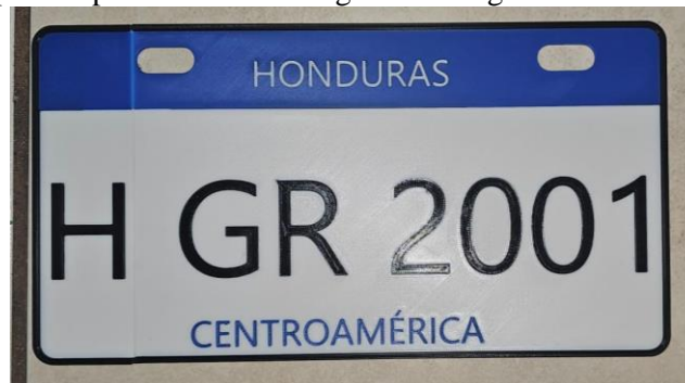
Fig. 3 Final result of printing vehicle license plates in 3D printing.

The Fig. 3 Final result of printing vehicle license plates in 3D printing. shows the final product of the 3D printed license plate, this is the result of joining Part A and Part B. In order to reach this final product, a process was established that will be described in the following section.