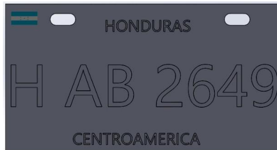
Fig. 1: SolidWorks vehicle plate design 1

Following the evaluation of the first pilot, necessary adjustments were identified and a second, more detailed and complete design was developed. This model, see Fig. 2 SolidWorks vehicle plate design 2 included adjustments such as: